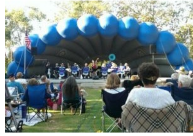
Sun, June 23 & 30 at 5:00 PM, free Location: HB Central Park behind the library <u>More details...</u>